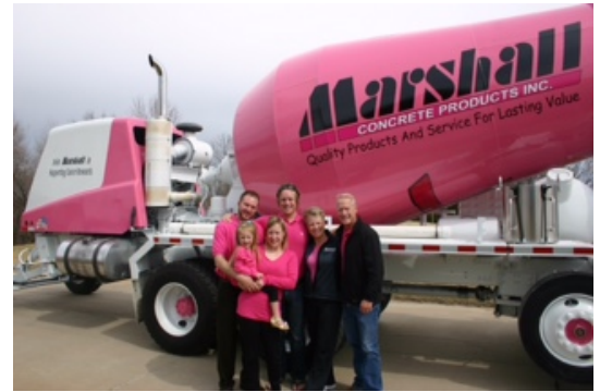
Marshall Concrete Products Inc., Minn./St. Paul, MN