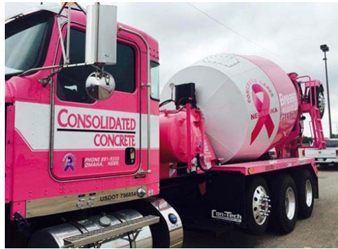
Consolidated Concrete, Omaha, NE